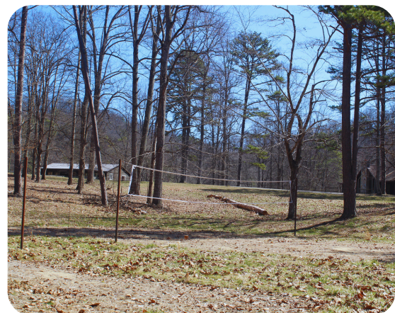
We also have two sand bottom volleyball courts, but those also need upgrading.

We've made it easy to donate by adding a form on our new website. In it, you can specify where your donation should go, and we've also added a way for you to select the amount you'd like to donate. All of the donations are tax-deductible, and we will make sure that you have a letter for your donation.