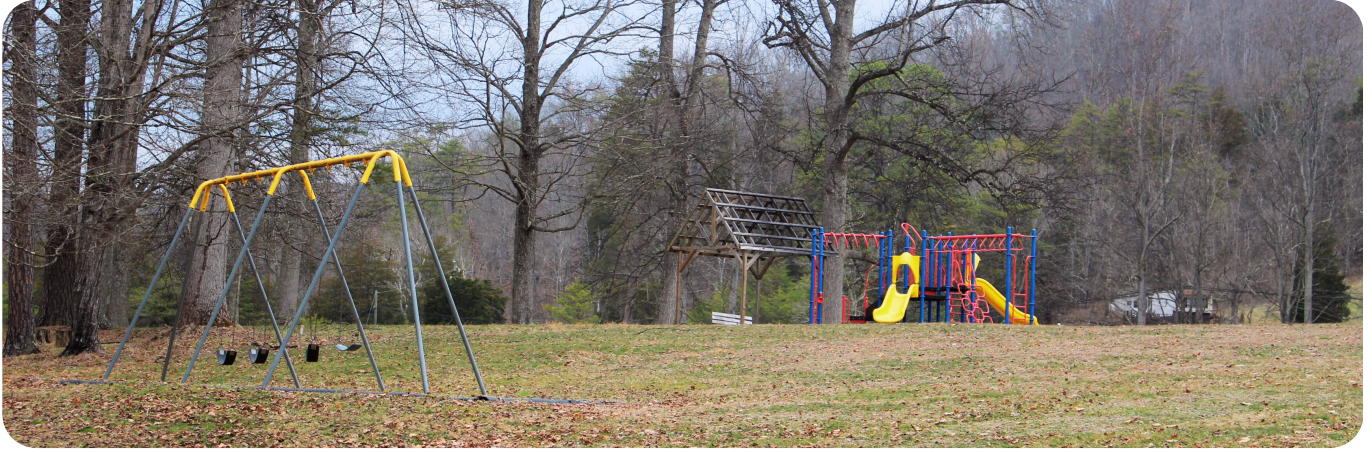
A photo of our only playground. We are working on adding more to the campground.